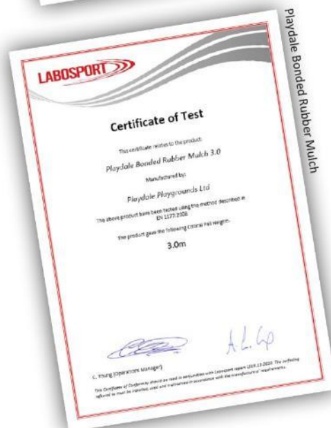
Playdale Bonded Rubber Mulch